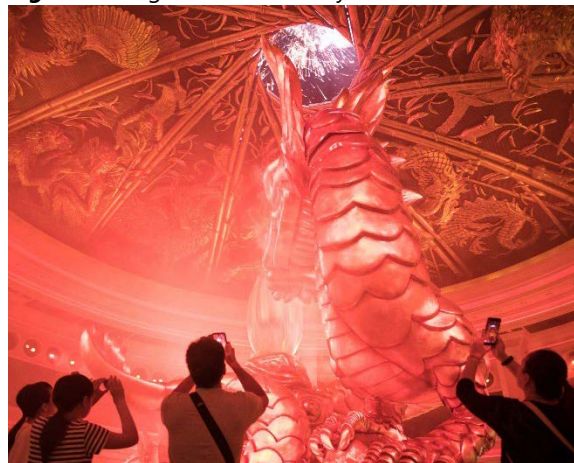
Figure 2. Dragon of Fortune, Wynn Casino, 08/08/2019

Macau's Portuguese authorities legalized gambling (as well as prostitution, opium production, and indentured servitude) in the mid-nineteenth century in an effort to revive the city's economy. The gambling industry typically operated as a government-owned monopoly that was farmed out to local associations for a share of the proceeds. Hong Kong tycoon Stanley Ho controlled the city's casino monopoly for the last four decades of Portuguese rule.