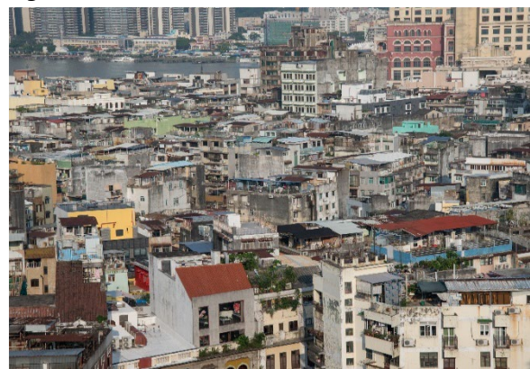
Figure 1. Macau from Fortaleza do Monte, 08/07/2019

Portuguese explorers founded Macau in 1557 to serve as a strategic port in the country's